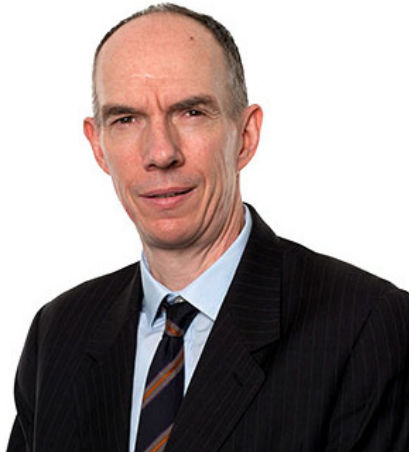
Sir David Ramsden Deputy Governor of the Bank of England

“It is vital for the Bank of England to engage with communities across the UK – we can’t make informed decisions without this input – so I’m very grateful to Heart of Bucks Community Foundation for bringing so many charities together for this event and for hosting us.