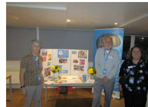
Quarrendon Community Cafe