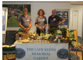
Lady Ryder Memorial Garden