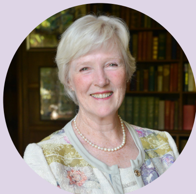
A message from HM Lord Lieutenant of Buckinghamshire

"It is so exciting to know that this year, Her Majesty The Queen will become the first British Monarch to celebrate a Platinum Jubilee after 70 years of service. To mark this epic reign the whole country and the Commonwealth is invited to become involved.