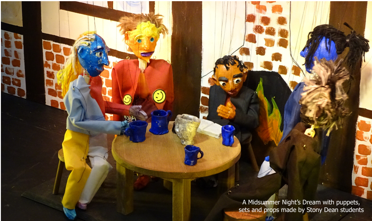
A Midsummer Night's Dream with puppets, sets and props made by Stony Dean students

Project: Teaching students how to make and use puppets in preparation for a full puppet show to their schoolmates and teachers