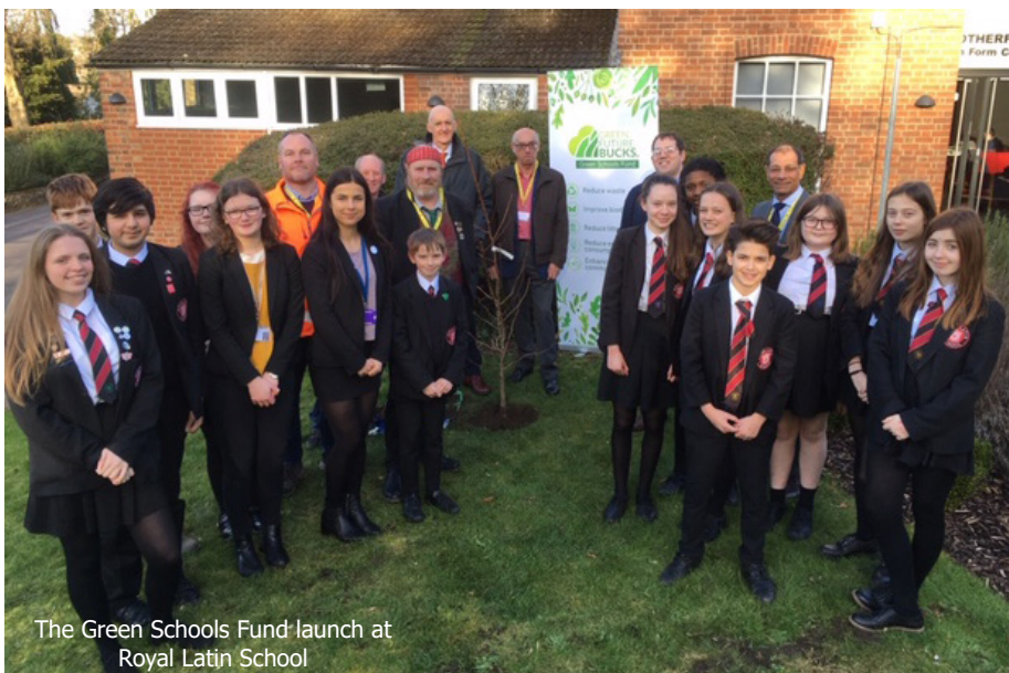
The Green Schools Fund launch at Royal Latin School

The fund is open to voluntary and community groups in the Aylesbury Vale area, awarding grants for projects designed to improve the environment and/or public spaces for the benefit of AVDC residents. Grants of up to £2,500 can be applied for, although again larger grants will be considered if they have the potential to make a big impact on the local community.