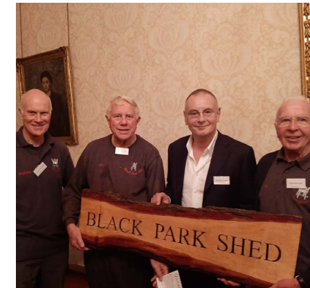
Black Park Shed awarded £500 as runners up