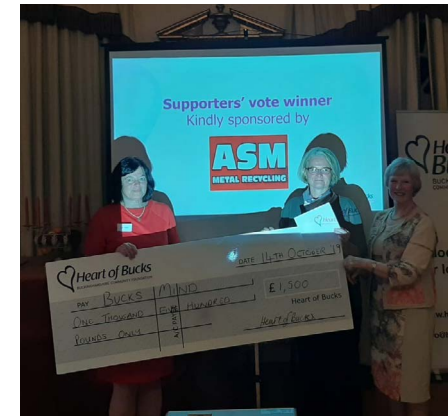
Bucks Mind awarded £1,500 as winners of the supporters' vote