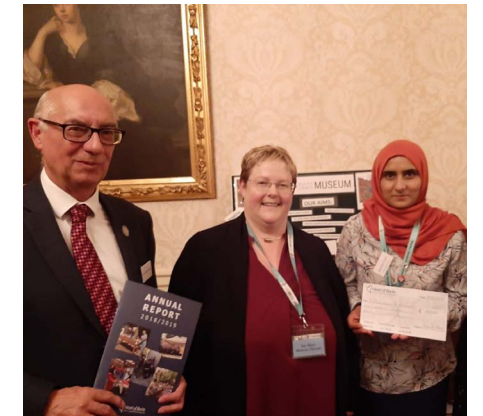
Bucks County Museum awarded £500 as runners up